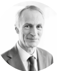
Jean-Dominique Senard Managing Partner Chief Executive Officer of the Michelin Group